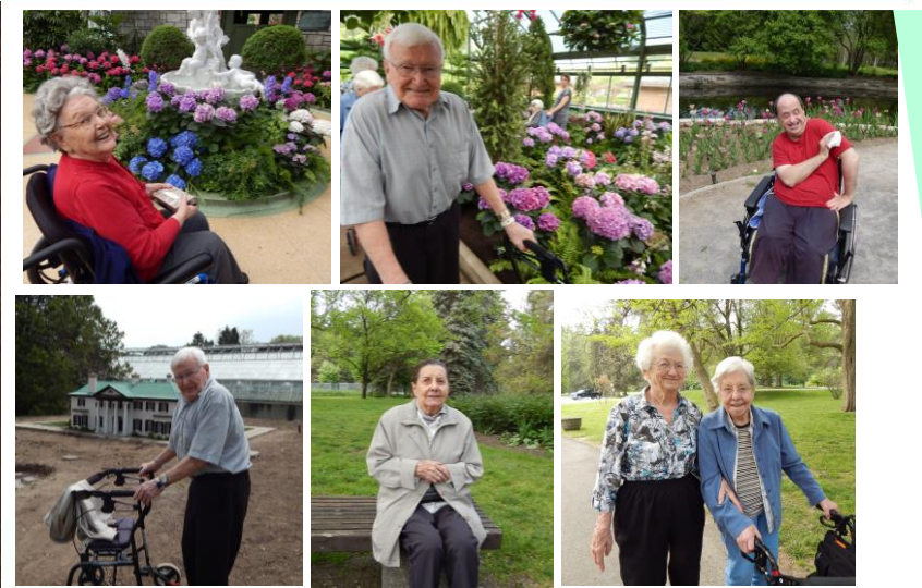
Our trip to the Floral Show house in Niagara Falls.